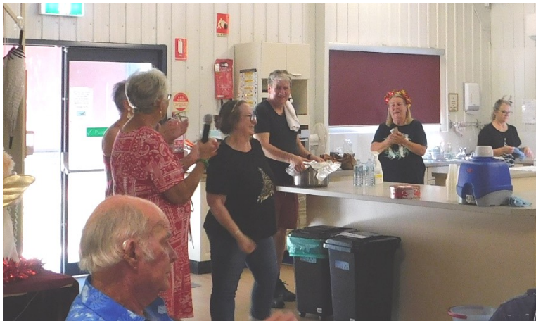
Thanking our caterers from Serenity Cafe