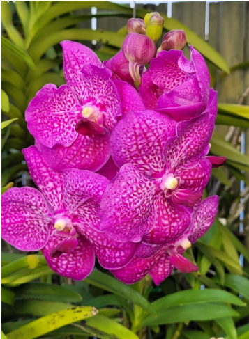
V. Somsri Blue Classic X V. Prayard Muang Ratch 2