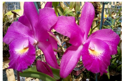
Pot. Hsinying Pink Doll 'Hsinying' X C. Tigrina 'Topaz'

If you have any plants that flower between meetings, email the photos to our Bulletin Editor— sandyjens@bigpond.com for inclusion in the next bulletin.