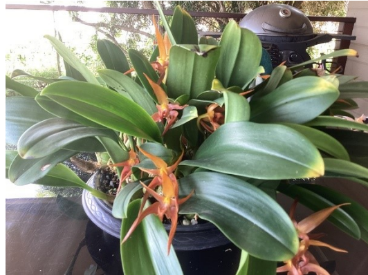
Bulb. basisetum x Bulb. lobbii 'Star Dust'