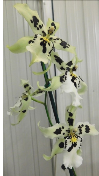
Alcra. Snowblind 'Sweet Spots'