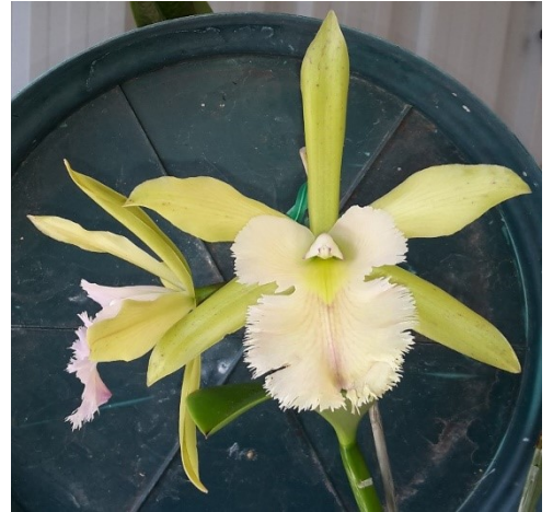
(Ctt. Aussie Sunset X Ctt. Redland Doll) X Ctt. Sixpence)