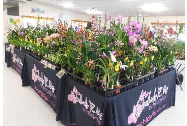
Windemere—Orchids R Us