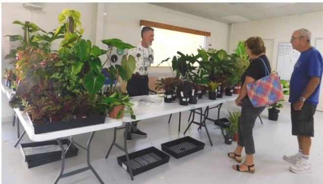
Steve Flood Tropicals well on the way to selling out