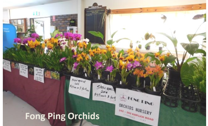
Fong Ping Orchids