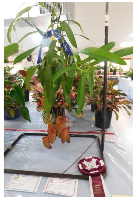
Reserve Champion Foliage