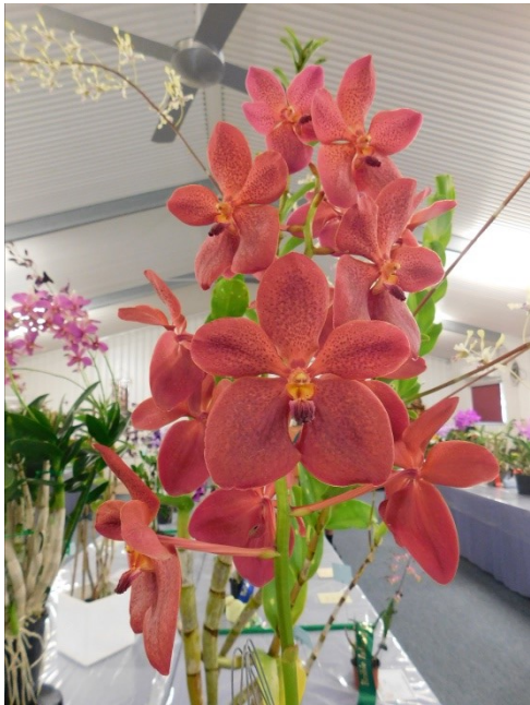
Champion Orchid of Show Renatande Cherry Rose Growers R & L Trost