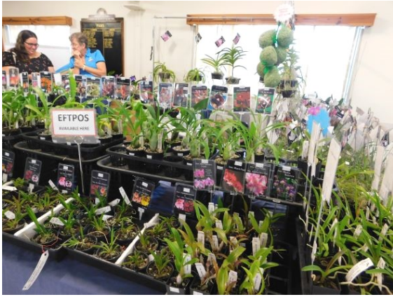
Pacific Beach Orchids