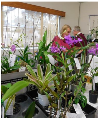
BIOS Plant Sales