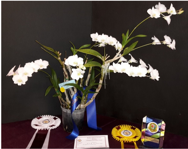
Champion Species and Champion Australian Native